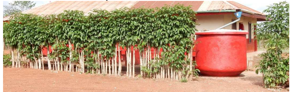
Big experimental tank of 15000 litre and red tank at Inclusive Primary and Secondary School in Nwofe.