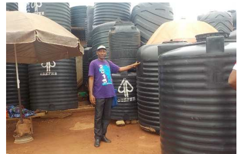
Effata helps young people to find work and to get a training on the job after study. Plastic tanks for sale everywhere.