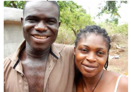
The man on the right side is a plumber, he just married and made a special tap (middle) for his wife.