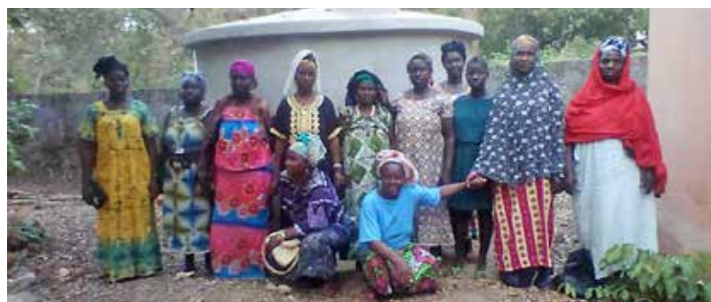
Women of Buba in front of a 10.000L. Calabash Cistern

The Calabash cistern plays a driving part in an innovative culture that people have generated themselves. Benefits of changes at home and at schools are now visible and accessible to many people; after all, the cisterns are built by the villagers themselves together with the local women.