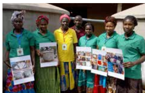
Women at Evangelical Church Guinea-B