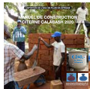
Our MANUAL the key to spreading knowledge