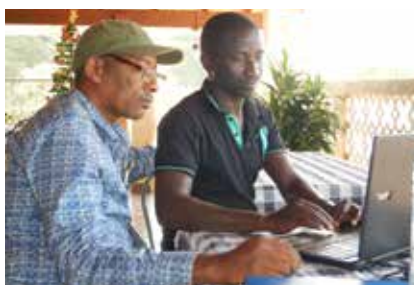
coordinators write a report