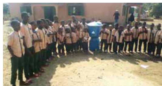
washing hands at school

The Calabash cistern plays a driving part in an innovative culture that people have generated themselves. Benefits of changes at home and at schools are now visible and accessible to many people; after all, the cisterns are built by the villagers themselves together with the local women.