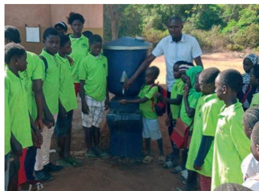
Mini Calabash at home and for hand washing at a school in Buba