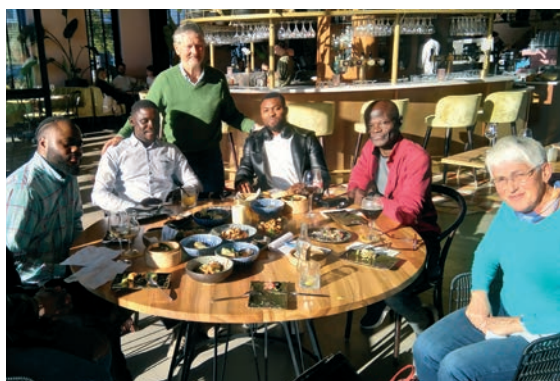
Consultation project leaders from DR Congo and Ghana in NL.

Perspective: As a board, we think we are on the right way. Continuity comes first! The projects in Africa follow their own paths: sometimes go fast, sometimes stagnate. We keep contact through our network, exchange data and techniques, promote and support training sessions. In the Netherlands, we try and find closer co-operation with smaller fellow organisations, such as: Ghana Over de IJssel, CBR Effata, Heart and Hands Congo, Drinking Water to Cameroon. We have found solutions at "grassroots" level. Now the question remains if we can take another step with the support of larger organisations, like, for example, the United Nations Development program, UNICEF or the World Food Program (WFP), etc.