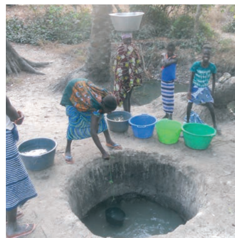
How drinking water is still often obtained!