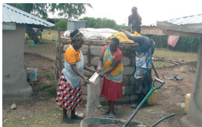
Masaai women from Emburkutia participate in training. They have started their own construction team in Kenya.

Perspective: As a board, we think we are on the right way. Continuity comes first! The projects in Africa follow their own paths: sometimes go fast, sometimes stagnate. We keep contact through our network, exchange data and techniques, promote and support training sessions. In the Netherlands, we try and find closer co-operation with smaller fellow organisations, such as: Ghana Over de IJssel, CBR Effata, Heart and Hands Congo, Drinking Water to Cameroon. We have found solutions at "grassroots" level. Now the question remains if we can take another step with the support of larger organisations, like, for example, the United Nations Development program, UNICEF or the World Food Program (WFP), etc.