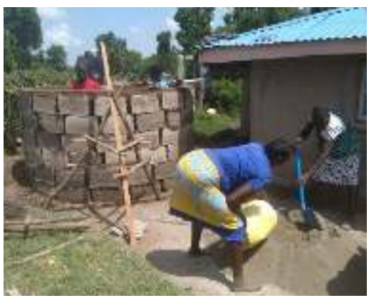
During the training each team constructs 2 Calabash Cisterns of 5000 L. The cement blocks or clay blocks are meant to construct the mould. Later the blocks will be removed. The mould makes it possible to construct the essential round shaped bottom of the Calabash Cistern.